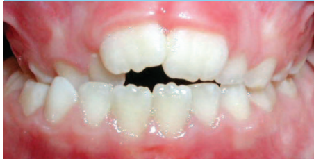
Crossbite of Back Teeth

Top teeth are to the inside of bottom teeth