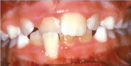
Crossbite of Front Teeth

Malocclusions (“bad bites”) like those illustrated below, may benefit from early diagnosis and referral to an orthodontic specialist for a full evaluation.